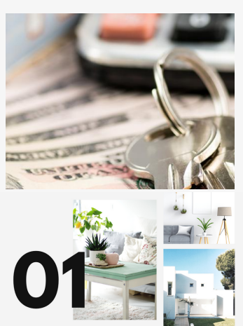
TALK TO A PROFESSIONAL!

So, if you're ready to begin the selling process, reach out and let us help you along the way!